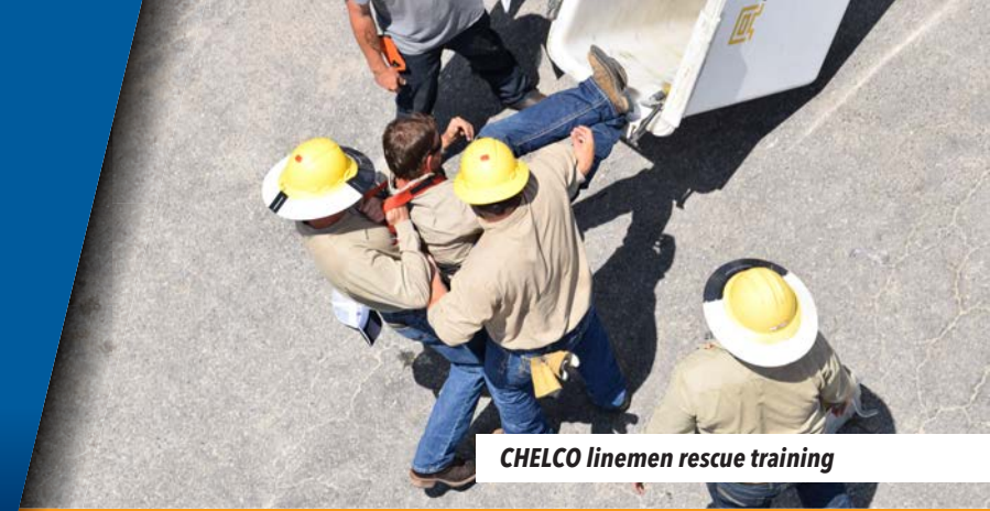
CHELCO linemen rescue training